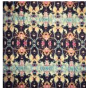
Picture 2 - Designer Portrait